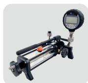
Digital pressure gauge PDR1000 0.025% PDR500 0.1% PDR250 0.25%