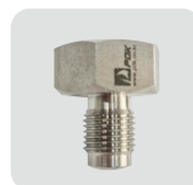
Quick adaptor 3 High pressure 9/16" UNF F Cone Threaded