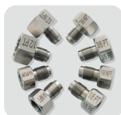
Quick adaptor 1 (1/8", 1/4", 3/8", 1/2" PT/PF & NPT Female set)