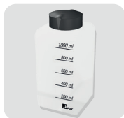
External reservoir 1L