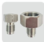
Quick adaptor 2 M14 x 1.5, M20 x 1.5 Female Metric set 2 ea