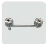
External pressure manifold